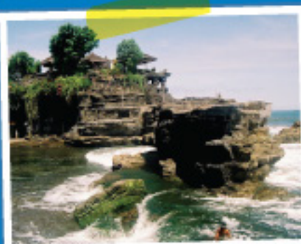
"TANAH LOT TEMPLE"

Featuring the shape of Genta (Hindu's priest bell), it is located only 10 minutes away from POP! Teuku Umar. Built around 1987 to immortalize the soul and spirit of Balinese people. Furthermore it hosts numerous of charm trees which cannot be found on any other part of Bali