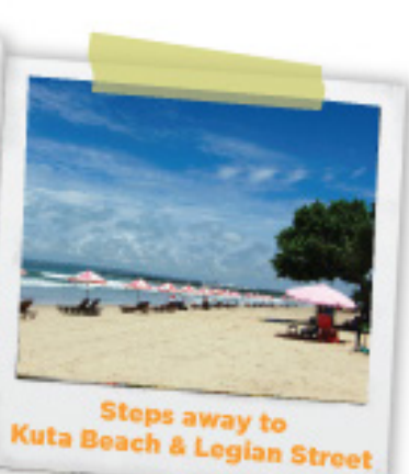
Steps away to Kuta Beach & Legian Street