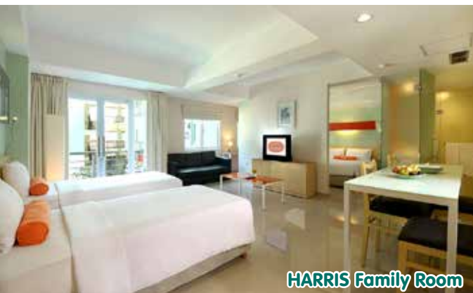
HARRIS Family Room